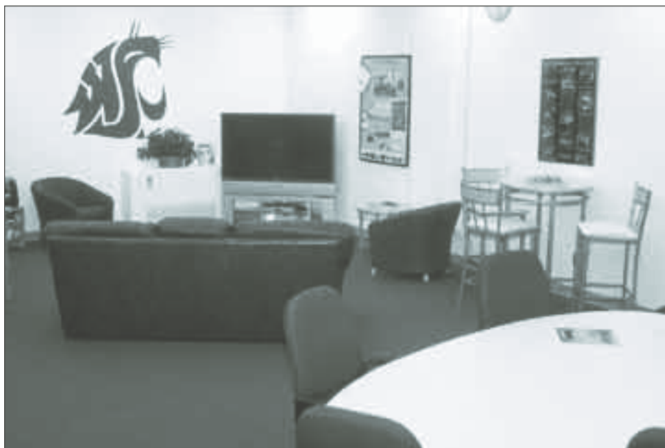
WSU's P.R.O.W.L. Resource Center